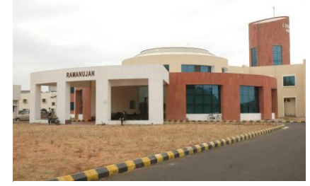
Ramanujan Building: short course venue

There were just over thirty participants and we all enjoyed the friendly atmosphere and